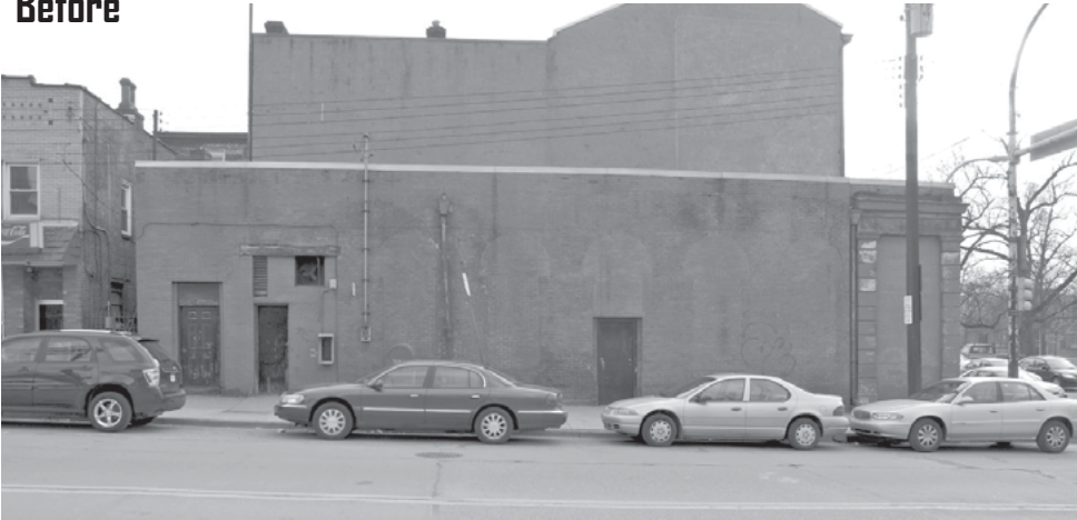
"Side view of 2 East North Avenue viewed from Federal as it exists currently"