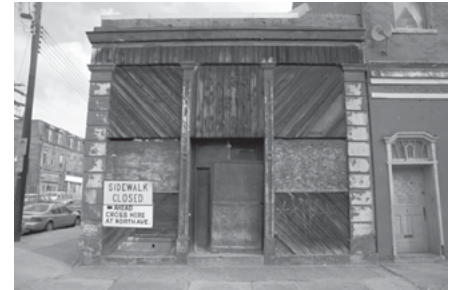
"Front of 2 East North Avenue as it exists currently"