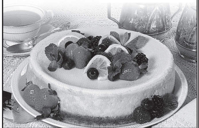
fine baking in the old tradition