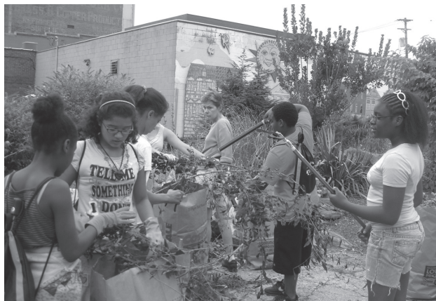
Today's Kids sponsored by the Pennsylvania Resources Council