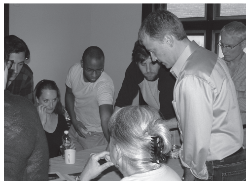
Focus group participants use a visual exercise to help North Star better understand the Central Northside.